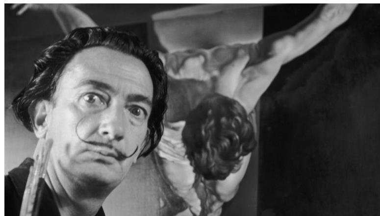
Salvador Dalí in his studio in Port Lligat with his painting 1951 painting Christ of St John on the Cross

Wednesday July 26 2023, 1.15pm BST, The Times